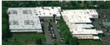
Corporate headquarters, Danboro, PA